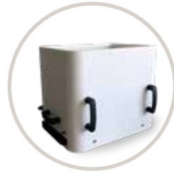
Stratasys H350 build removal box Simple, transportable add what you need