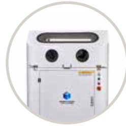
Powder retrieval station Solution for Stratasys H350 printer or your choice