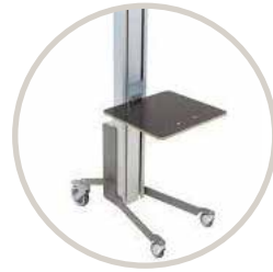
Trolley Easy build box transport